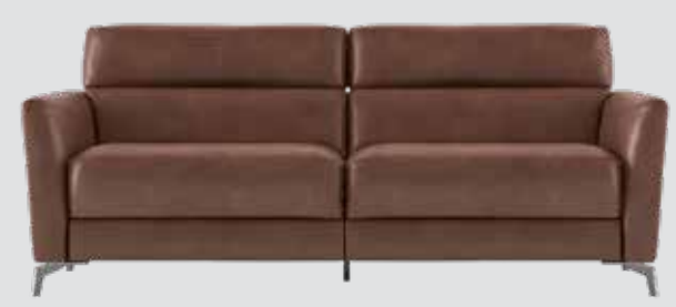
Three-seater sofa H87 - W206 - D97 cm H35 - W81 - D38"