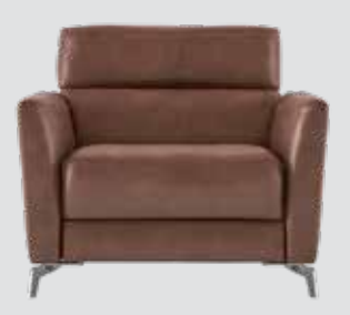
Armchair H87 - W98 - D97 cm H35 - W39 - D38"