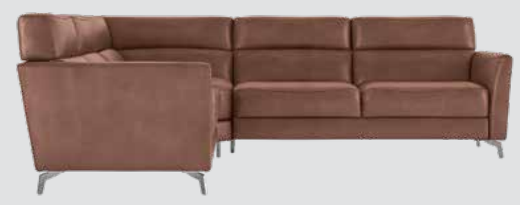
Sectional H87 - W293 - D206 cm H35 - W115 - D81"