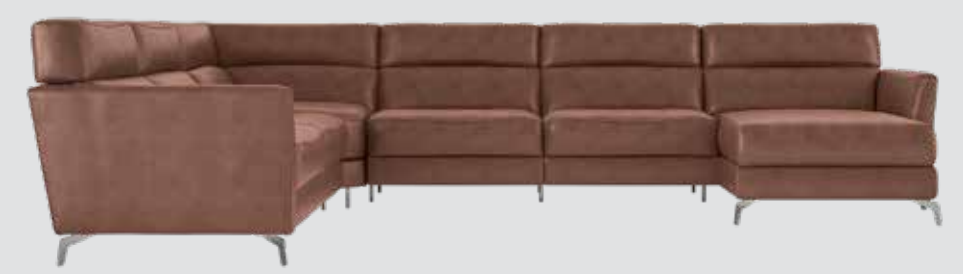
Sectional with chaise H87 - W292 - D378 cm H35 - W115 - D149'